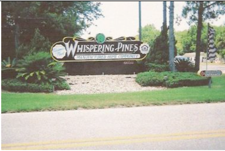
Entrance to the Manufactured Home Park S. Orange Blossom Trail in far right