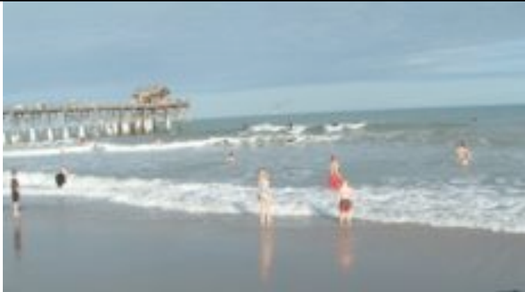
Cocoa Beach in January! About an hour from Whispering Pines