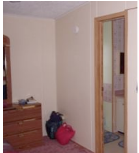
Queen bed in master bedroom with walk-in closet (left) and dresser (right); master bath with walk-in shower