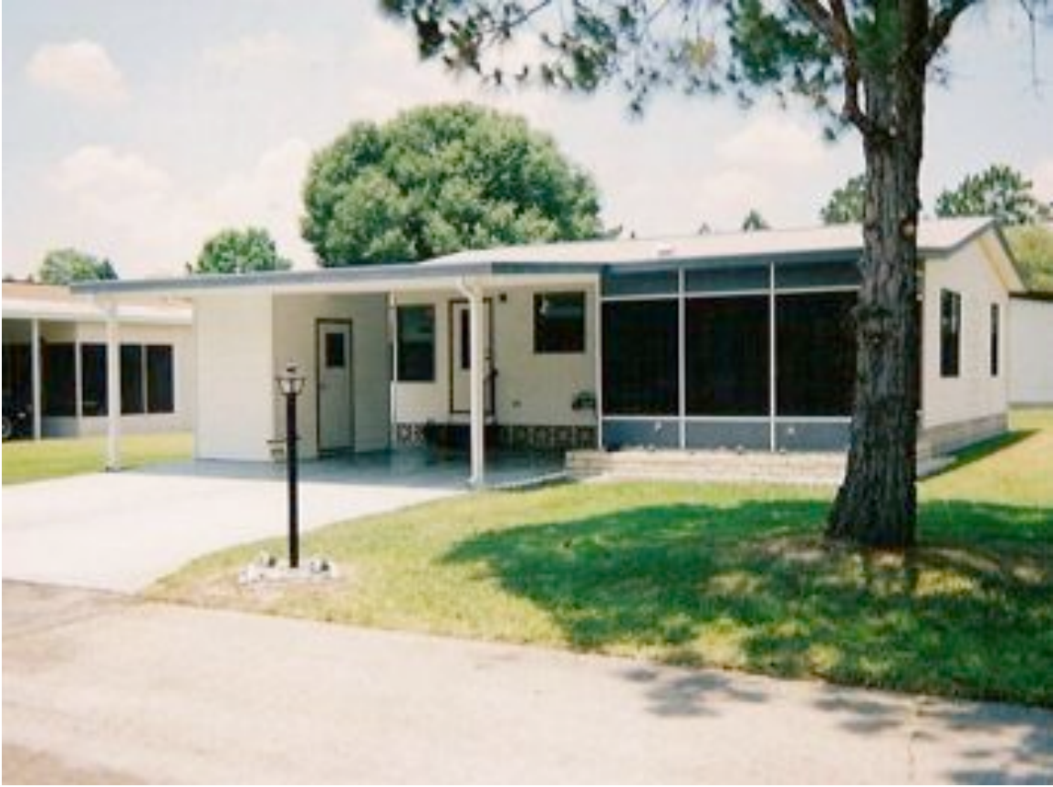
Babcock's manufactured home just south of Kissimmee at 1716 Conifer Street