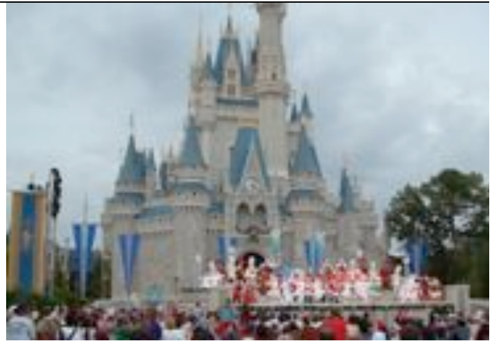
Disney World on New Year's Eve! About 10 miles from Whispering Pines