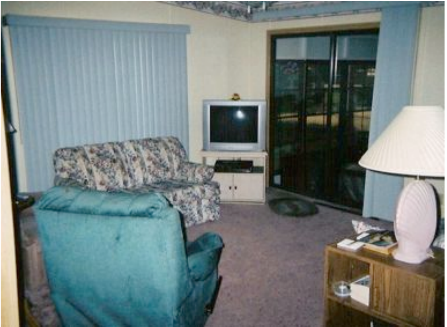
Living room and sliding door out to Florida room