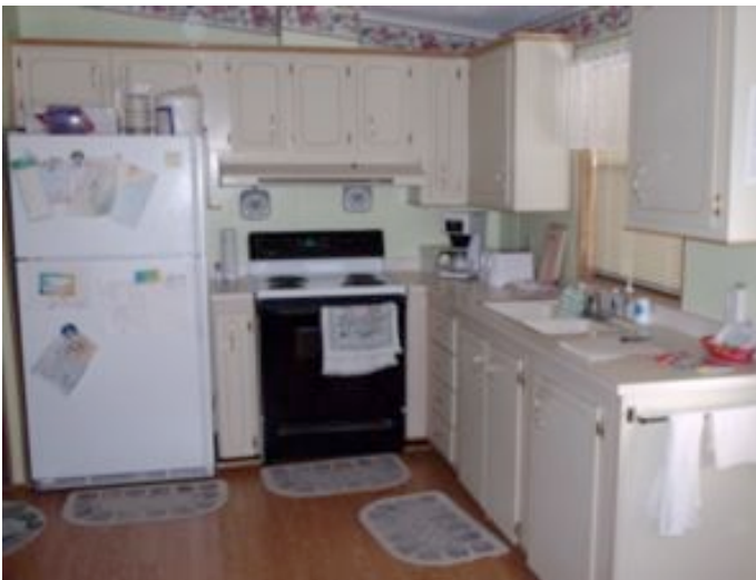
Kitchen, all electric plus washer and dryer off to left