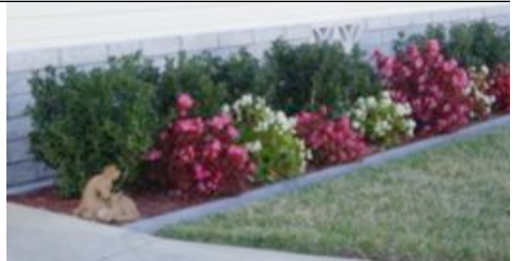
Flowers in March! Not ours unfortunately