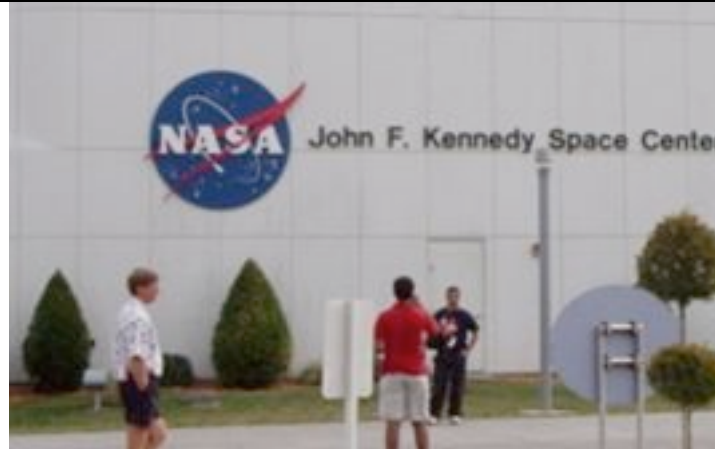
Space Center Visitor Center About 1 1/2 hour from park