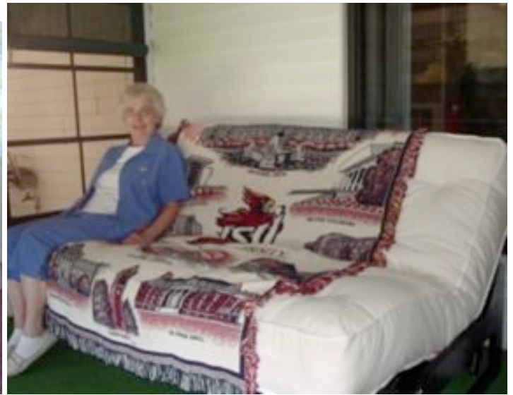
Guest bedroom with another queen-sized bed, dresser, and closet; Double bed futon in Florida Room