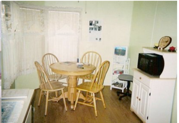
Dining nook, small TV, and microwave w/stand