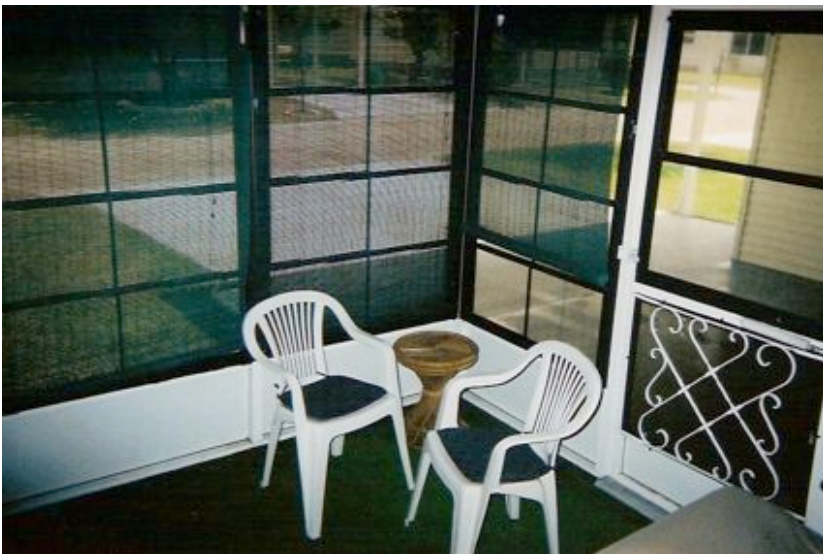
Florida room with view toward Conifer Avenue and doublewide drive with carport.